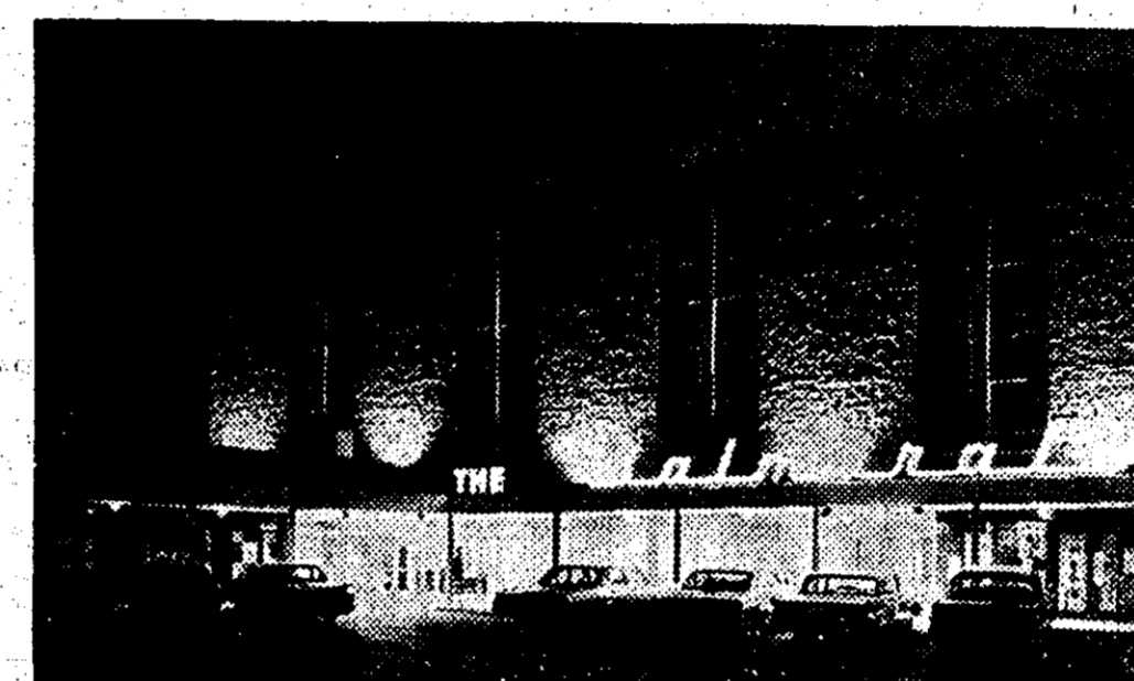
EXTERIOR VIEW OF BALMORAL MOTOR HOTEL.

ONE OF MANITOBA'S HISTORIC INTERSECTIONS IS NOW THE SITE OF THE BEAUTIFUL AND MAGNIFICENT NEW