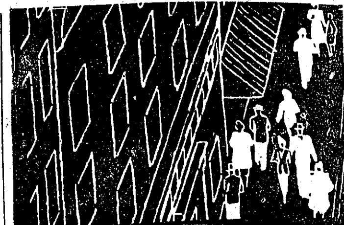
Thief River Falls Shopping

In a speech to representatives of the British Labor Party and trade unionists, Dr. Braunthal pointed out that Israel was battling for its survival as a state, for the lives of hundreds of thousands of its citizens and for democracy. He asserted that many critics of Israel had lost sight of the Socialist principles involved in the struggle and the fact that Israel struck first to defeat a carefully prepared assault by vastly superior forces.