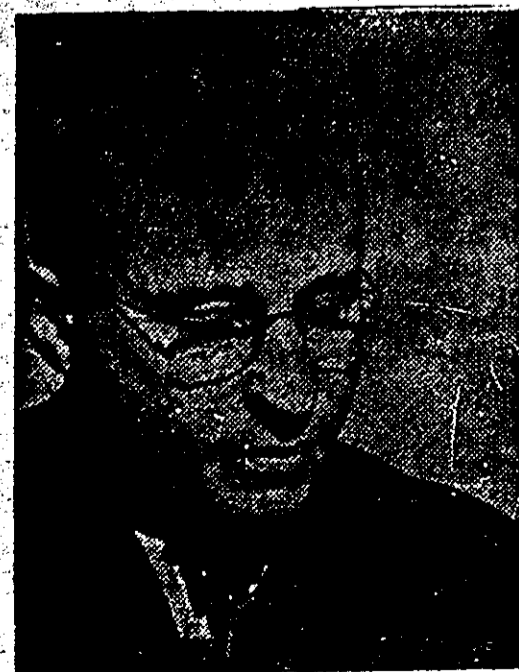
Jascha Resnitsky ... Conducts Orchestra