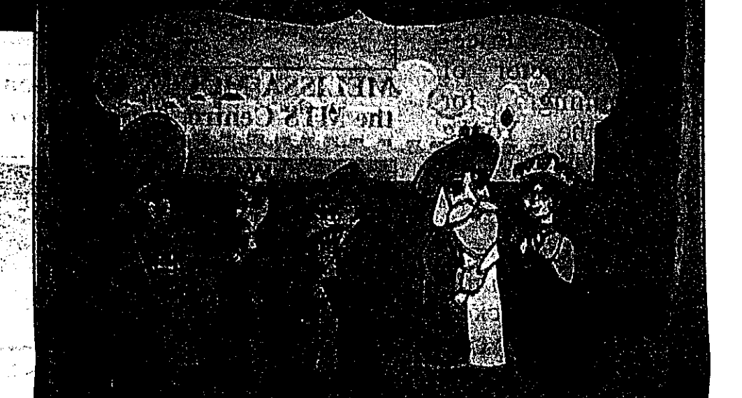
The children in costume had their pictures taken professionally by Rob Cohen Photography in front of this huge Purim backdrop.