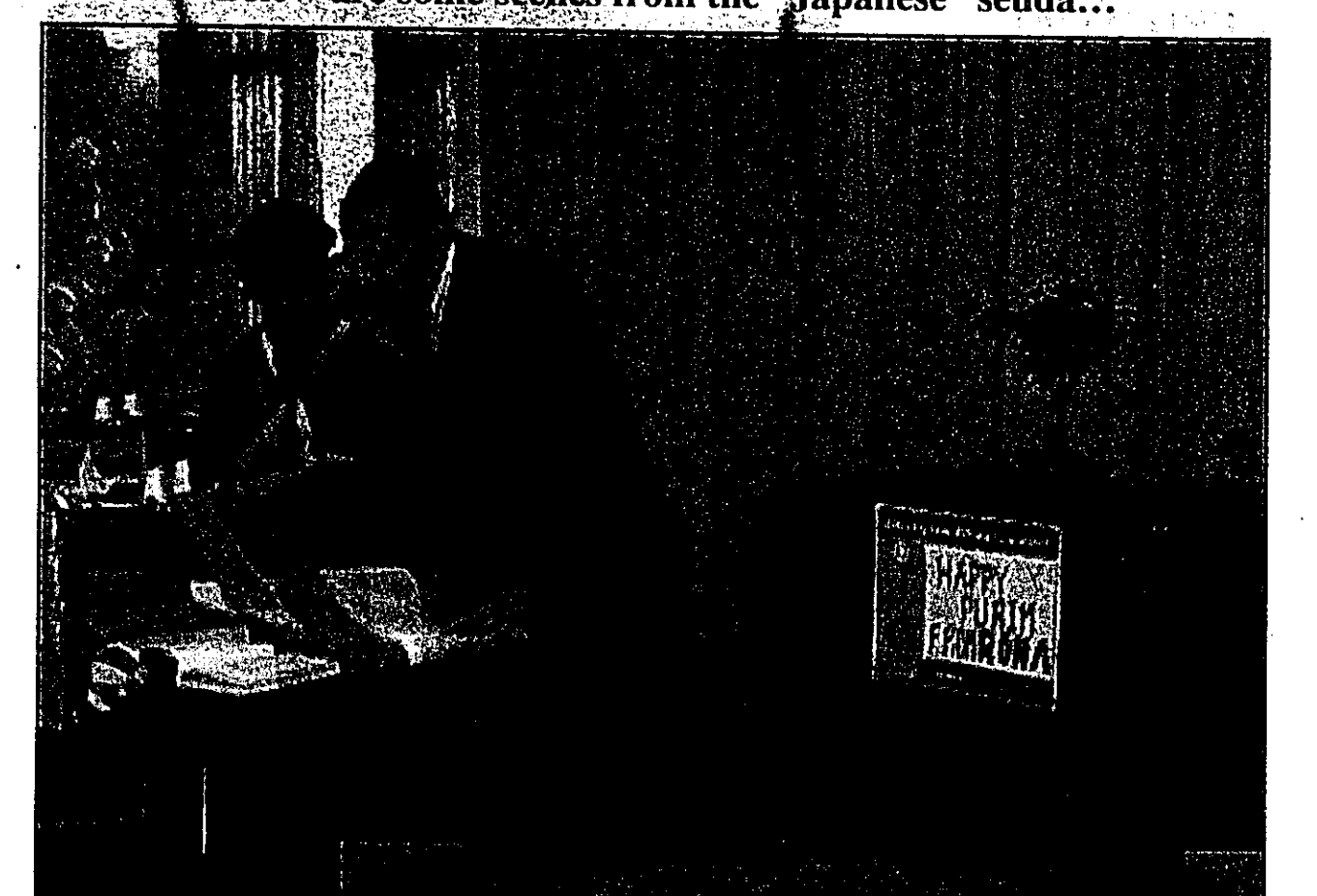
RABBI AVROHOM ALTEIN reads the Megillah (Purim scroll) in front of a bonsai display which included a fruit laden orange tree with fragrant blossoms.