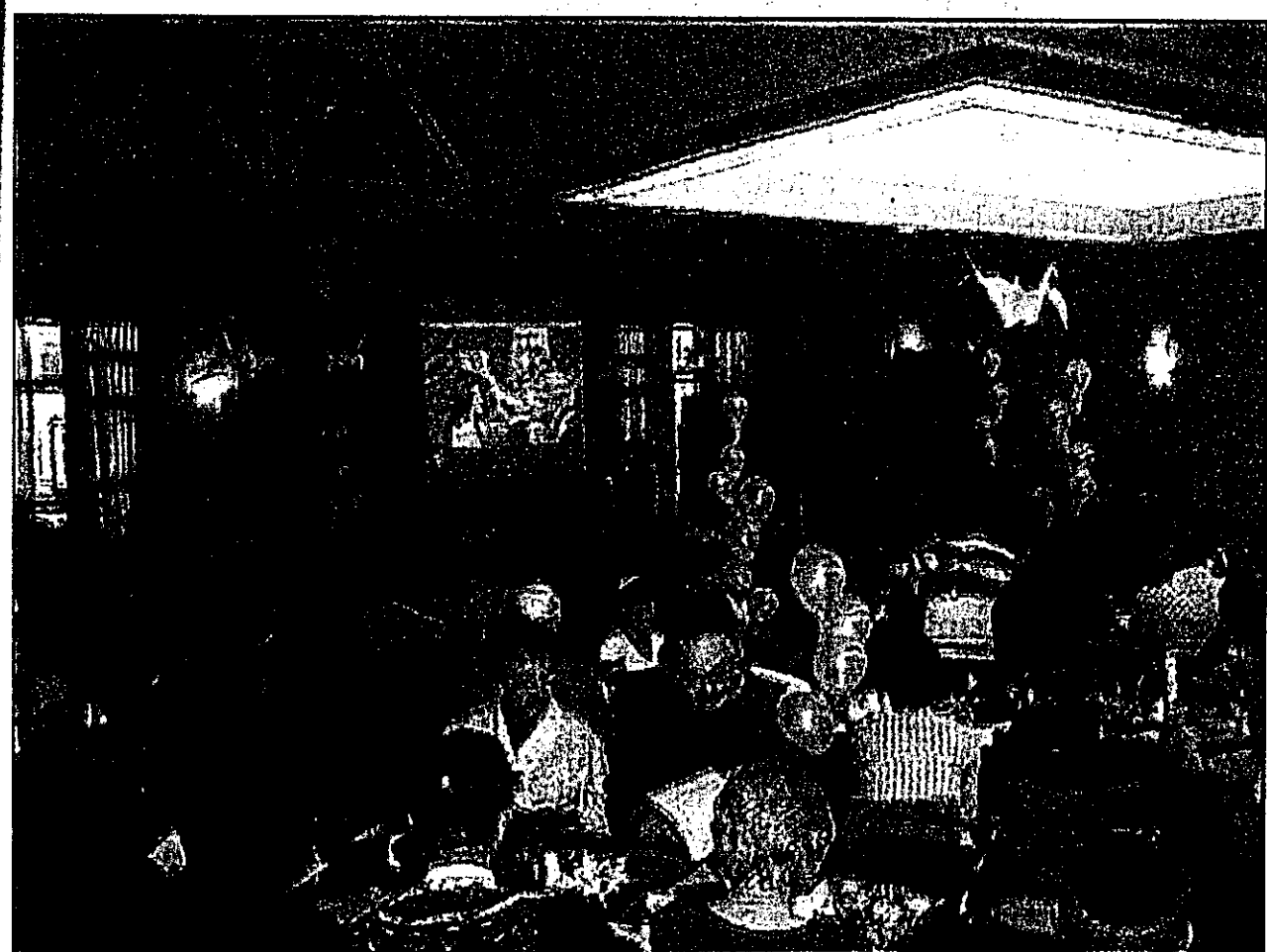
While listening to the Megillah, participants watched a silent presentation of the Purim story. Note the exquisite origami centre-pieces on the tables.