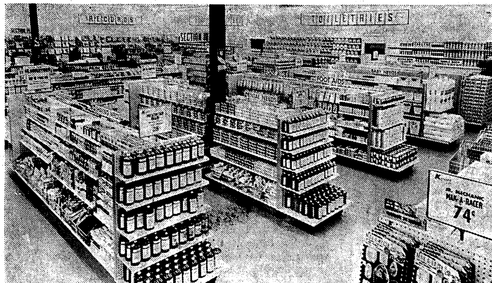
Dramatic view of the spacious and attractive K-Mart Shopping Centre