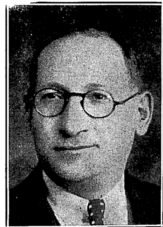
Best Wishes for a Joyous Passover to all our Customers and Friends

acquired some beautiful brocade or embroidery, and set it aside for the Seder night. A similar remark applies to the ewer and basin of brass repousse and chased work assigned for Seder use. Some of the table-covers, the table-centres, the covers for unleavened cakes and bitter herbs, found in various collections, belong to the same category; but others were distinctly made for Passover. Some of these table-centres (specially those of German provenance)