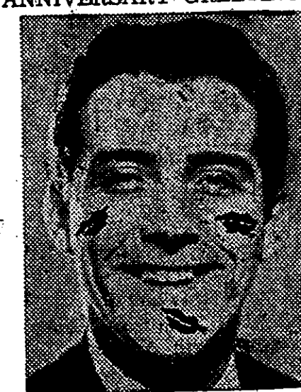
ALL I SAID WAS, "LET'S EAT AT JOHNNIE'S"

JOHNNIE'S RESTAURANT AND GRILL 10518 Jasper Ave. OPEN 24 HOURS Businessmen's Luncheons 75c up